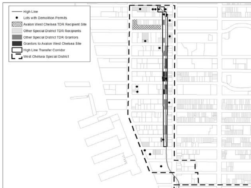
Figure 2: Development rights transfers in the Special West Chelsea District 90